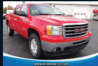
2012 GMC SIERRA 1500 SLE Z71 4 DR Like New, priced below book value.