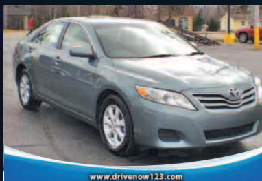
2011 TOYOTA CAMRY 4 DR America's most popular mid size.