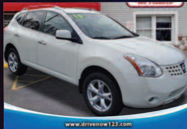
2010 NISSAN ROGUE SL Well Equipped Cross Over, low miles.