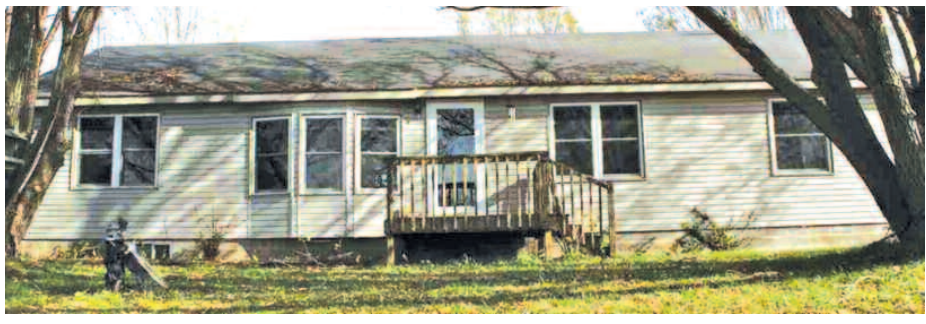
120 GARNER • EAST JORDAN