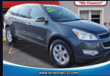
2009 CHEVROLET TRAVERSE LT Three Rows of Seating.