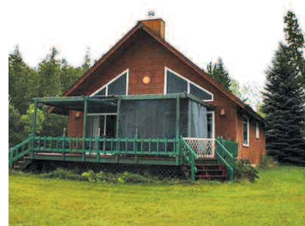
4563 MURRAY LANE • EAST JORDAN

This home is located in a quiet neighborhood and sits on approx. 5 acres with apple and pear trees surrounding it. Close enough to town for those quick trips in, but still has the country setting. This 3BR 2BA home also has a formal dining room and living room combination creating a "great room" that is perfect for family gatherings and entertaining and has a full basement that could be turned into a great extra family space. MLS #446689. $169,900. Ask for Holly Nierman or Mike Stark.