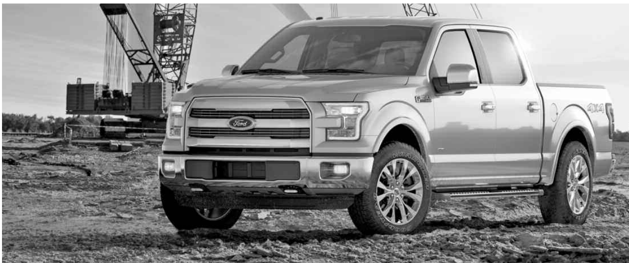
Green Car Journal has named the Ford F-150 its 2016 Green Truck of the Year™ at the San Antonio Auto & Truck Show.