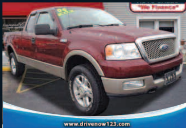
2004 FORD F-150 LARIAT 4 DR You won't find a better truck.