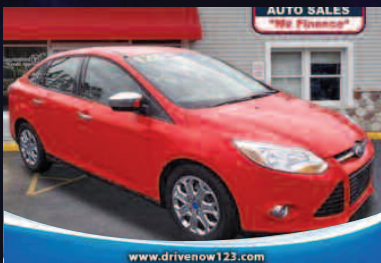
2012 FORD FOCUS SE Popular hatchback model, Great Full Economy.