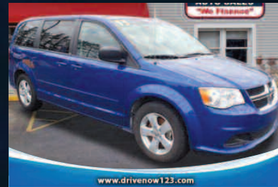
2013 DODGE GRAND CARAVAN SE Like New, Stow and Go.

GO TO WWW.DRIVENOW123.COM TO SEE THE ENTIRE INVENTORY AND COMPLETE AN APPLICATION