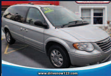
2006 CHRYSLER TOWN & COUNTRY LIMITED All the Extras Power Doors, Leather.