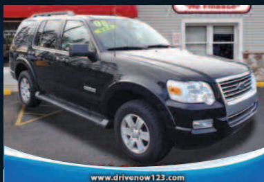
2008 FORD EXPLORER XLT Flawless 4X4!