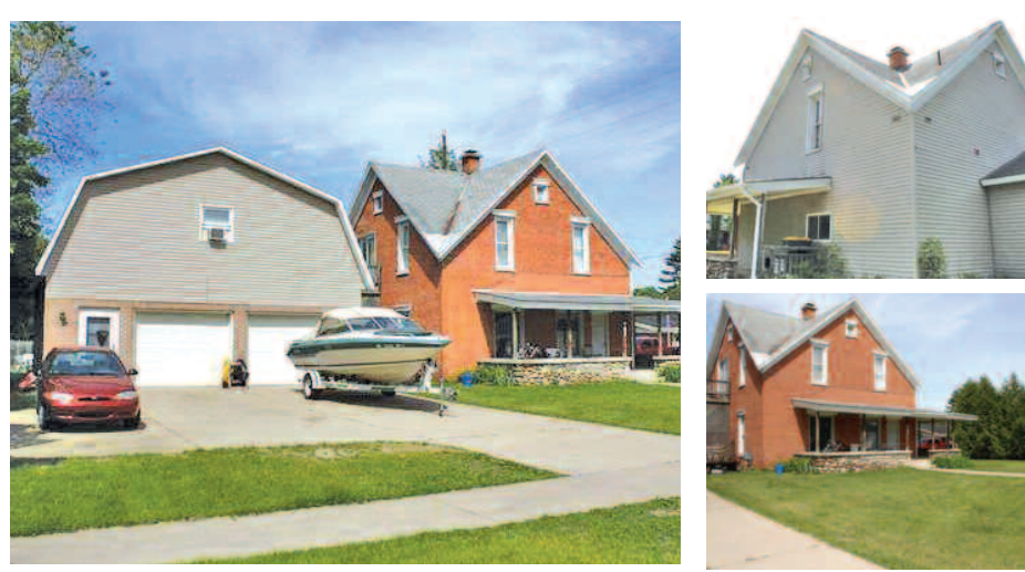
407 THIRD STREET, EAST JORDAN

Solid brick home that has been converted into 3 units. Very good tenant history. There is also a 2 car insulated finished garage. This also offers a shared laundry room in a very quiet neighborhood close to schools. MLS #444858. $99,900 Ask for Holly Nierman or Mike Stark.