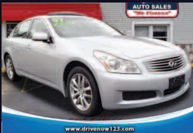
2007 INFINITI G35 X Luxury Sedan, Great Shape!