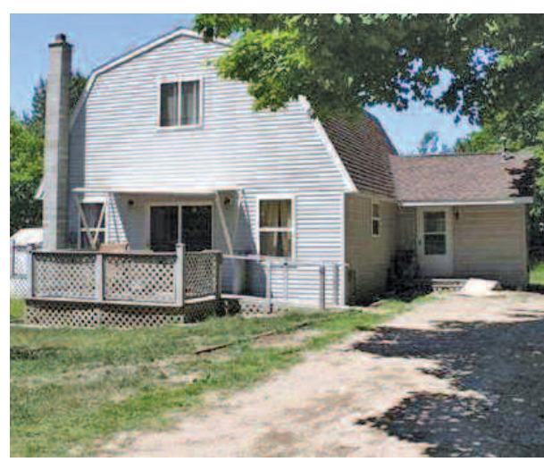
6878 BOSS ROAD • ELLSWORTH

Solid brick home that has been converted into 3 units. Very good tenant history. There is also a 2 car insulated finished garage. This also offers a shared laundry room in a very quiet neighborhood close to schools. MLS #444858. $99,900 Ask for Holly Nierman or Mike Stark.