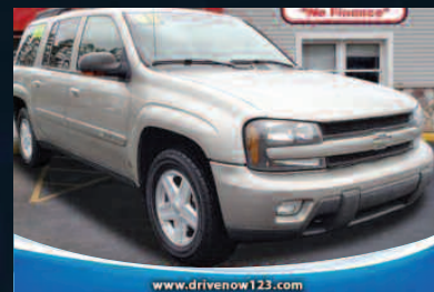
2003 CHEVROLET TRAILBLAZER LT Three rows of seats. 4WD