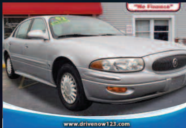
2002 BUICK LESABRE CUSTOM A Real Peach ONLY 62,500 miles.